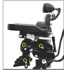
Anatomically correct hinge point positioning