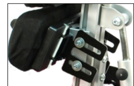
Tilt and rotation adjustability available for lumbar and back support