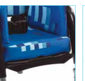
Potty insert for Fasy S