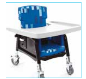
ht adjustable tray Seat pad for Easy Seat