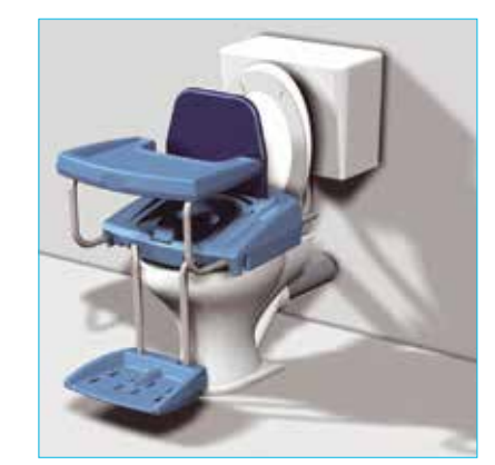
Over toilet seat