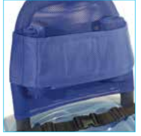
LAB/1/A Chest belt with laterals OTS/#/A Mounting bracket