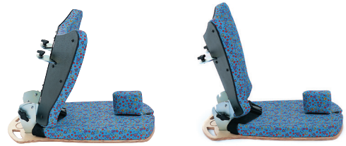
Prone and recline angled backrest