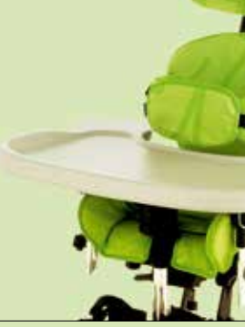
14. Activity tray