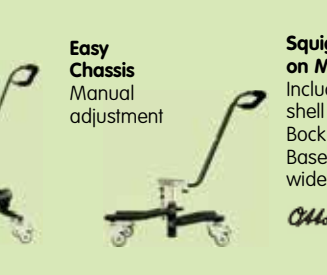
Leckey Outdoor Mobility Package (UK only)