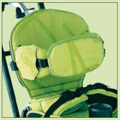
7. Optional chest harness