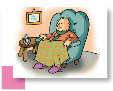
e-diary for home care symptom control