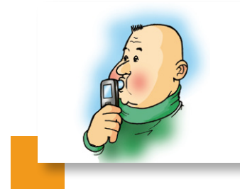
Spirometer with "Touch Screen" display