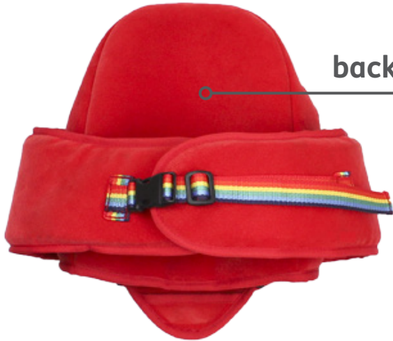
Advanced backrest cushion

The advanced backrest cushion is now height adjustable. The lateral can be raised higher or lowered depending on the height and size of the child.