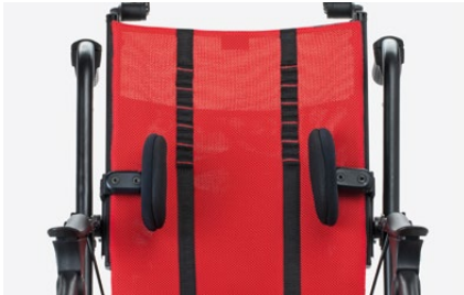
838 Trunk side supports adjustable in height, width and rotation. Available in two sizes.