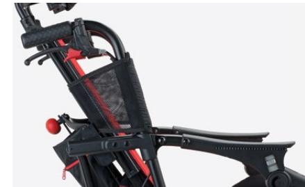
844 Padded side protection covers