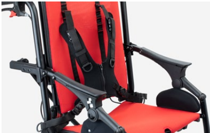
853 Vest harness with zipper