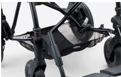
858 Shopping basket