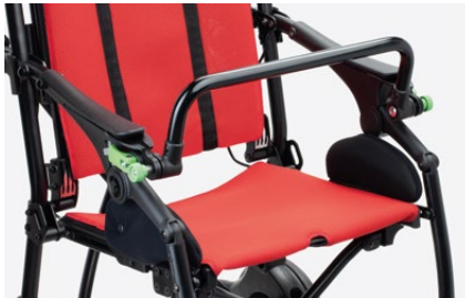
839 Front handlebar

Adjustable in tilt. Easy to remove to fold the stroller.