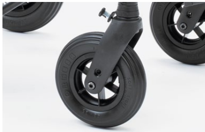
812 Front wheel direction locks