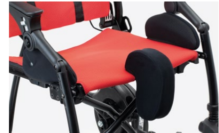
834 Padded abduction block removable. Available in two sizes.