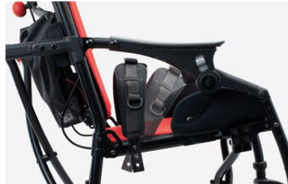
947 Pelvic belt with variable angle Available in two sizes.