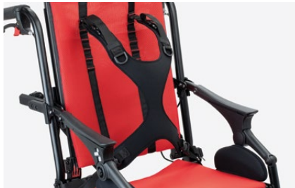
853 slim Four point shaped harness