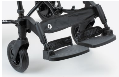
960 Heel rests

Adjustable in tilt. Easy to remove to fold the stroller.