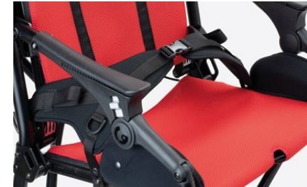
920 Four point pelvic belt Available in two sizes.