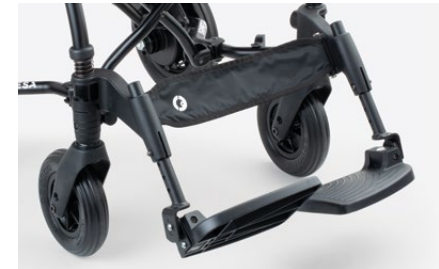
956 Footrests adjustable in tilt