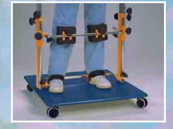
Adjustement of ADDUCTION-ABDUCTION OF LEGS.