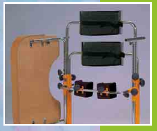
Removable WORK TABLE, IT IS ADJUSTABLE in height and depth.