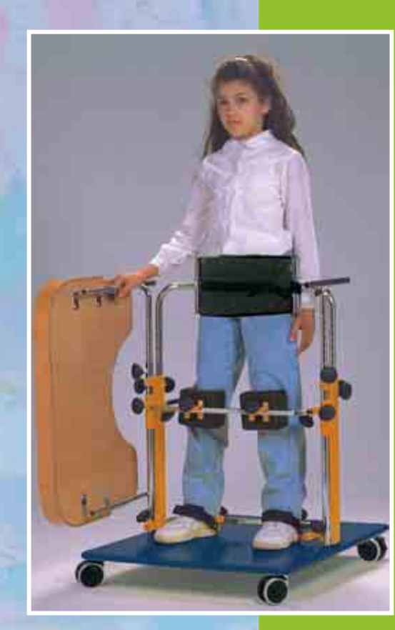
If the child has SUFFICIENT TRUNK CONTROL , only the PELVIC SUPPORT BAND is necessary.