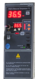
Modular control panel with soft-touch keys

The NWS101 is backed by the many years of experience PHOENIX has in designing and supplying sophisticated neonatal care equipment worldwide.