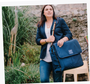
take it anywhere