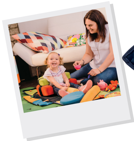
Colourful loops for attaching favourite toys

Once unzipped, the lightweight bag reveals a colourful floor mat and rolls, wedges and supports that stick together in dozens of ways, letting your child tackle different developmental postures.