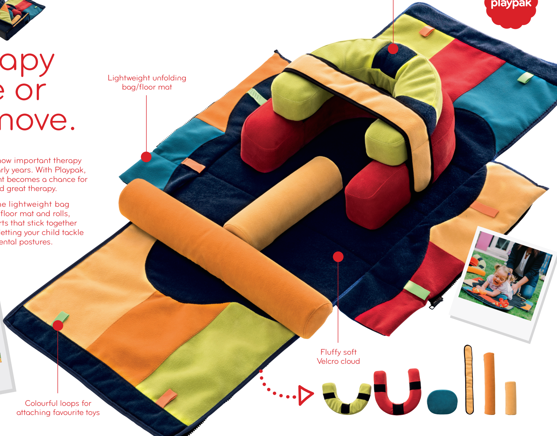
Fluffy soft Velcro cloud