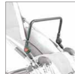
839 FRONT HANDLE