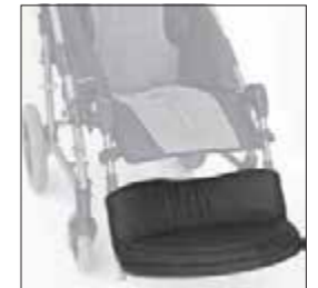
892 FOOT PLATE PADDED COVERING