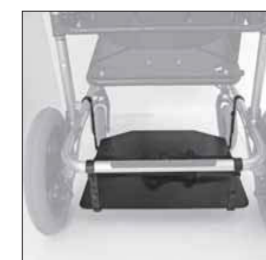
911 VENT TRAY , for carrying medical equipment (rear view)