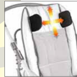
852 HEADREST with Parietal Supports. It is adjustable in height and width