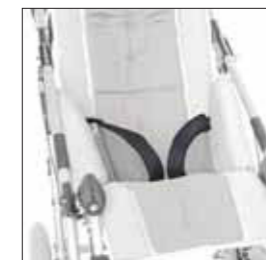
817 INGUINAL STRAPS