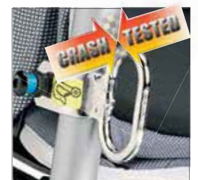
891 SET OF 4 TIE DOWN HOOKS for the forward-facing transport of the pushchair in a motor vehicle (private vans/cars, buses..)