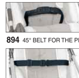
894 45° BELT FOR THE PELVIS