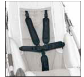
906 FIVE POINT HARNESS