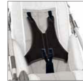
903 FIVE POINT VEST HARNESS