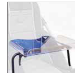
824 TRANSPARENT TRAY