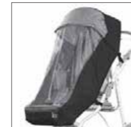
825 RAIN COVER to be fixed to the 819 canopy