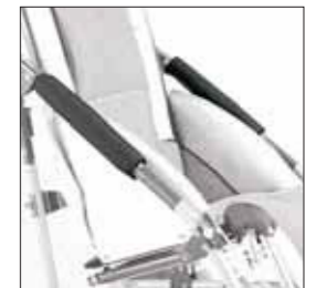
844 SIDE PROTECTING COVERS