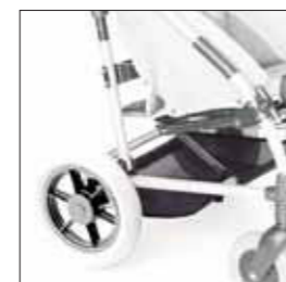
858 MESH BASKET