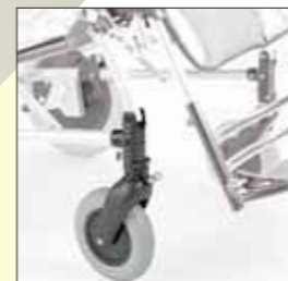
812 WHEEL DIRECTION LOCKS