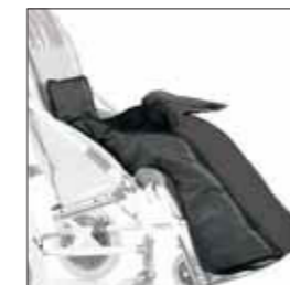
818 THERMAL COVER