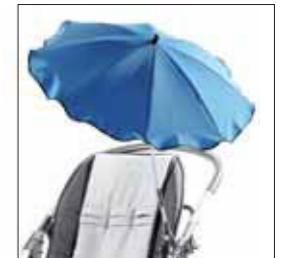
854 PARASOL matching with the upholstery