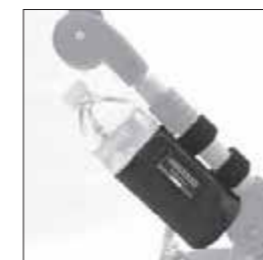
922 BOTTLE HOLDER