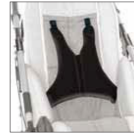
853 VEST HARNESS