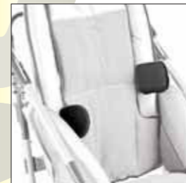
838 PADDED SIDE SUPPORTS