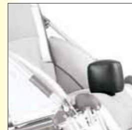
834 ABDUCTION BLOCK