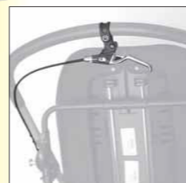
905 HAND BRAKE (rear view)