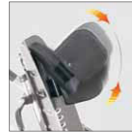
863 HEADREST with Occipital-parietal Supports. It is adjustable in height, in width, in tilt, forwards and backwards