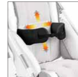
868 SIDE WRAPPABLE and FLEXIBLE SUPPORTS for the trunk. Height and width adjustable